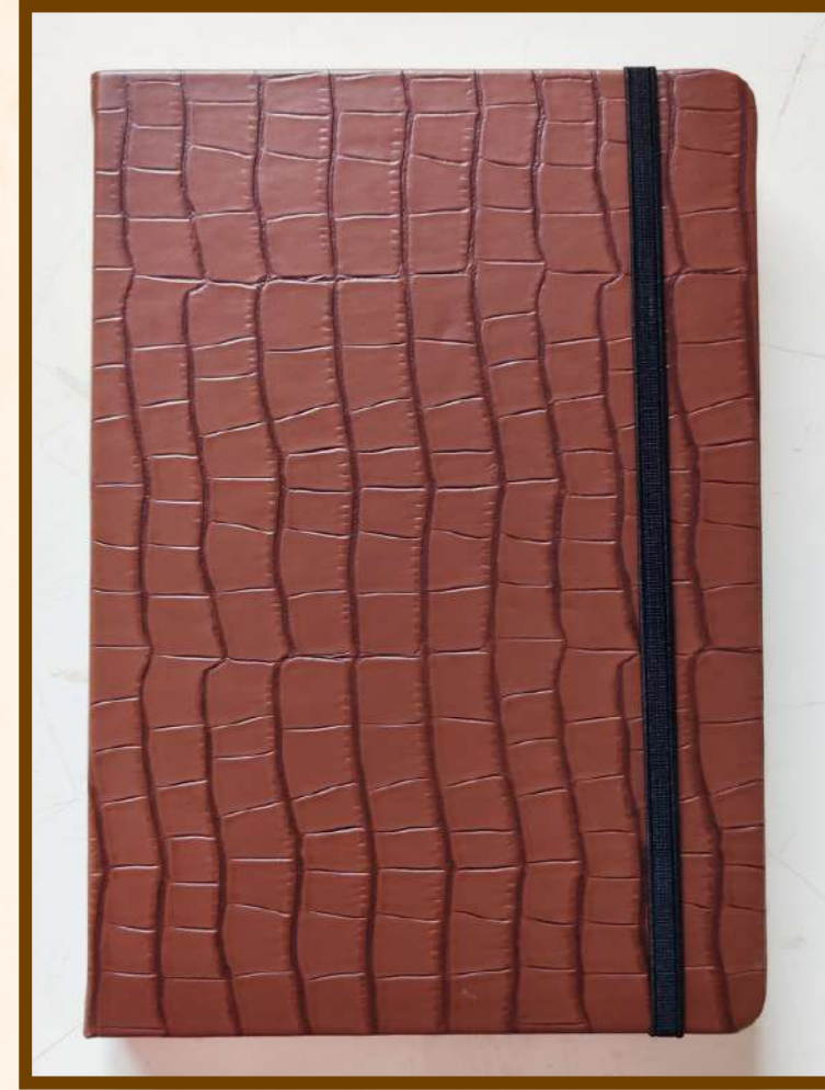
CLASSIC ELASTO LOOPY