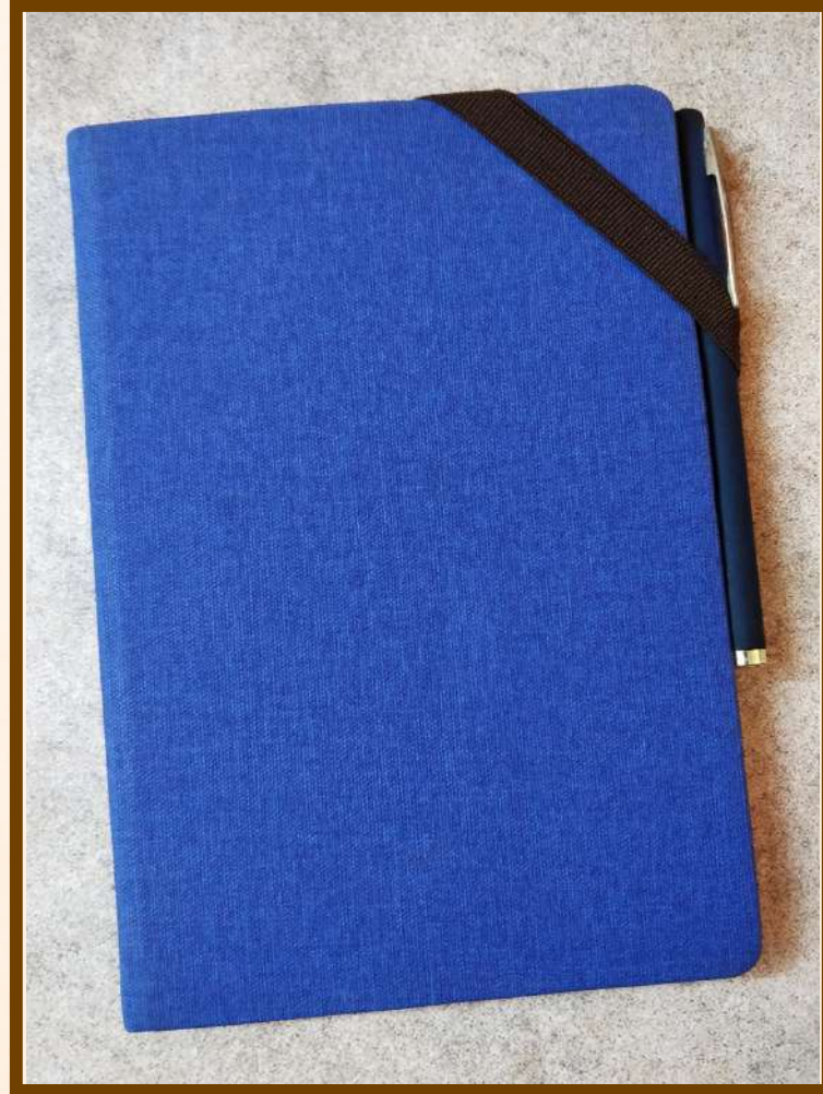
CORNER ELASTO LOOPY