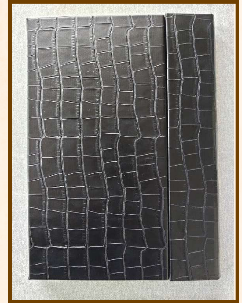
DOUBLE MAGNET LOOPY